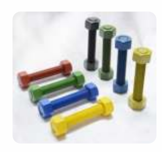
Teflon Plated / Ptfe Coated