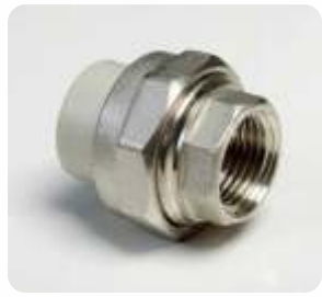
Hot Dipped Galvanized Plated